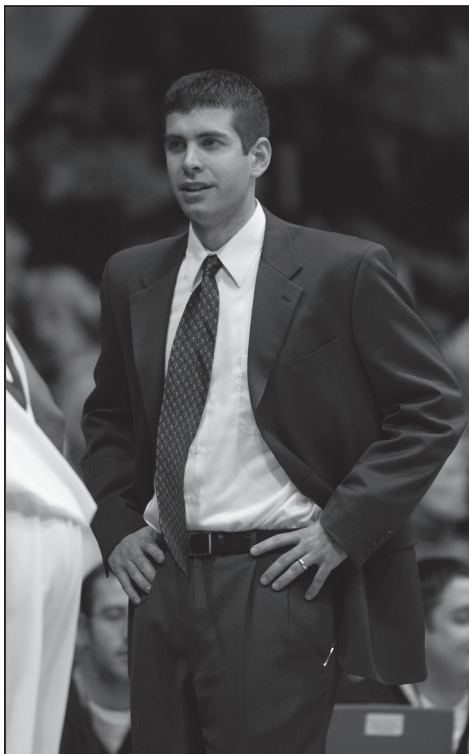
Brad Stevens began his head coaching career by becoming the first coach in school and Horizon League history to record a 30-win season.

•Brad Stevens was the only assistant coach in Butler basketball history to help the Bulldogs to two NCAA Sweet 16 appearances.