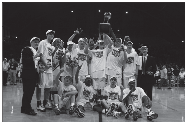
Butler defeated Cleveland State to win the 2008 Horizon League Men's Basketball Championship at Hinkle Fieldhouse.

Note: First round games will start at 7 p.m. local time.